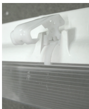
White Secure Locking Plastic Latch* 12 per fixture (Standard)