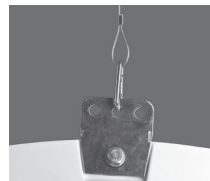
End Mount Bracket (clip not included)