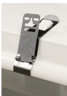
Zinc Plated (Standard) VHA2-MS-ZP 4 per fixture

Optional: 316 Stainless Steel (FIO Option V) VHA2-MS-SS