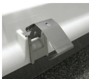
316 Stainless Steel Latch* (FIO: Option S)