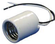
Mogul Socket LH-MOE-01