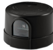
Twist lock long life photocontrol Multi-volt, fail-on, 8A at 120V and 5A at 277V HI-LL-127-15-BK-A