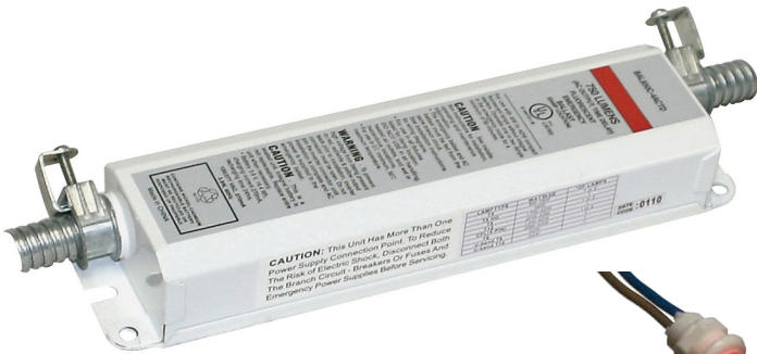
LED Test switch included.