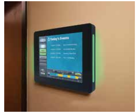
MeetingMinder™ Touch10 Mounted - Room available

We're happy to provide pricing and specifications for individual units, facility packages, or integrated solutions combining Touch room signs with our RoomBoard™ and custom interactive wayfinding maps.