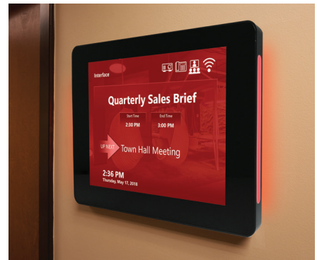
MeetingMinder™ Touch10 Mounted - Room booked