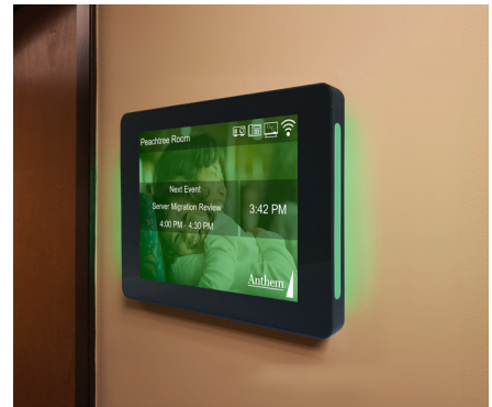
MeetingMinder™ Touch10 Mounted - Room available

Visit www.visix.com to learn more, and contact us for pricing at salesteam@visix.com .