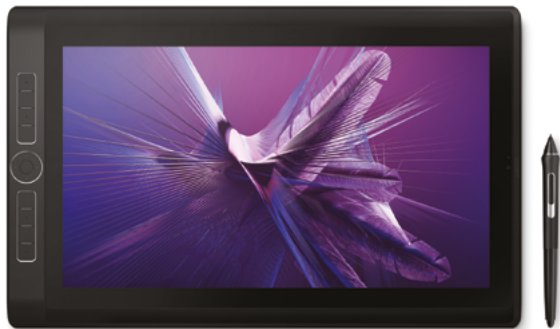
Wacom MobileStudio Pro 16 Featured artist: Future Deluxe

Whatever, wherever... you can create anything with Wacom MobileStudio Pro. With its awesome display, a precise and powerful pen, plus enhanced computing power, you can enjoy true independence. Not only that, its complete studio of creative tools, exceptional graphics and long battery life means nothing can compromise your creative flow.