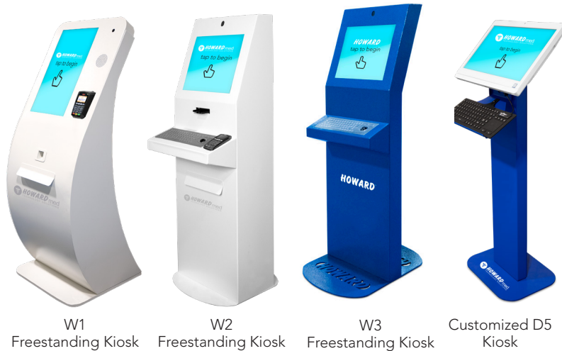
W1 Freestanding Kiosk W2 Freestanding Kiosk W3 Freestanding Kiosk Customized D5 Kiosk