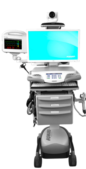
TeleCare with accessories