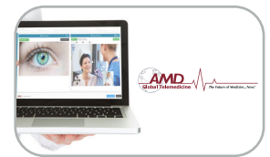
AMD Global Telemedicine AGNES Connect Software