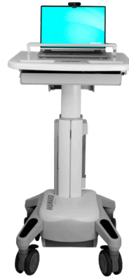
TeleCore notebook cart