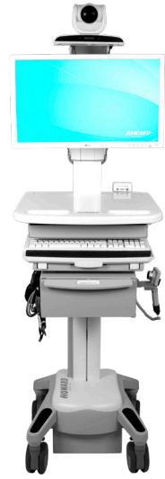
TeleCore LCD cart