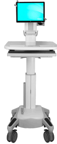
TeleCore tablet cart