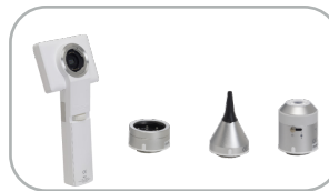
Multi-purpose Exam Camera With General Viewing, Otoscope, & Dermoscope Lenses