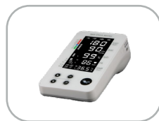
Spot VSM with BP, Temp, and SpO2 (requires storage)