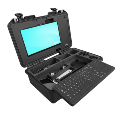
Rugged Telemedicine Kit-19