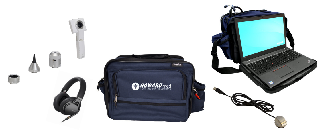
Telehealth Shoulder Bag Soft Telemedicine Kit

The Soft Telemedicine Kit is designed for mobile telehealth applications to improve the level of care in a variety of use case settings. Our light weight, non-powered soft kit provides your facility with a simple and effective approach, allowing you to configure your telemedicine kit for in home care or physician consultation. We incorporate high density foam inserts to securely house your chosen technology or diagnostic devices and offer multiple storage pockets to accommodate multiple configurations.