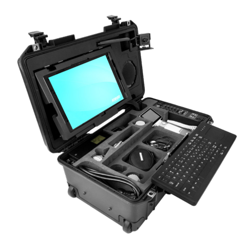
Rugged Telemedicine Kit-22

The Rugged telemedicine kit (RTK) is an essential element in providing telemedicine services. This versatile kit can accommodate the equipment necessary to service patients anywhere you intend to go. Our RTK offers a way to expand your telemedicine program beyond the walls of your facility.