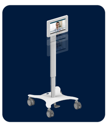
Available with height-adjustable options for easier viewing angles, whether seated, in bed, or standing