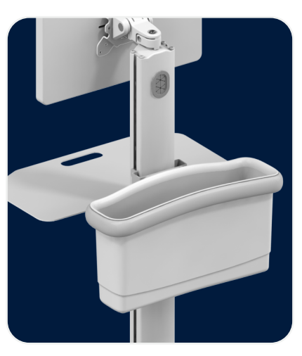
Compatible with many cart accessories