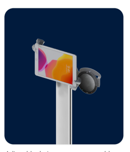
Adjustable design supports most tablets with 8" to 13" screens