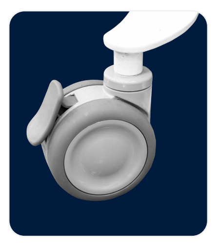
4" premium dual-wheel casters allow for easy deployment to patient rooms, clinical triage, office location, and more

Expand your telehealth presence in a flash with the HI-View and HI-Rise cart families. These carts provide clinicians a safe way to interact with patients via video chat and can be equipped with a speakerphone mount for hands-free communication. In addition to being sturdy and lightweight, which makes it highly maneuverable, these carts are also available with fixed height or height adjustable, making it easy for people of varying heights to use it comfortably if that fits your workflow. The tablet mount also allows for a wide variety of tablets to best fit your facility's needs. Enable your healthcare workers to safely connect to their patients remotely—no travel time and costs associated.