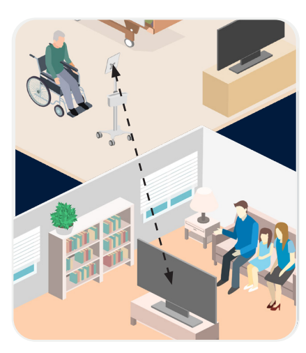
Reduce physical contact to limit the spread of infection