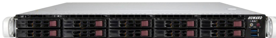
The SP3-1110 Server Solution

Howard Storage Solutions Are Good for Business!