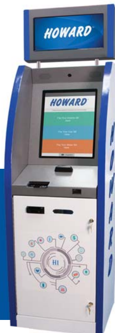
Howard Two INDOOR