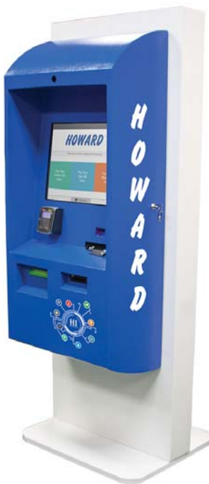
Howard One INDOOR/OUTDOOR