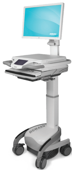
HI-CARE X NO STORAGE