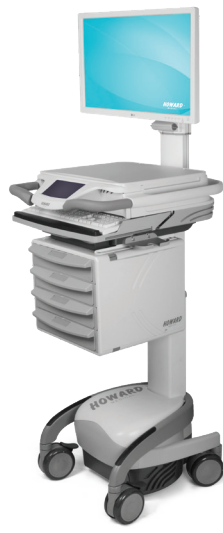
HI-CARE X 4-TIER STORAGE