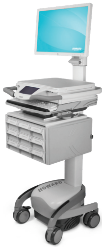
HI-PARADIGM X 3-TIER