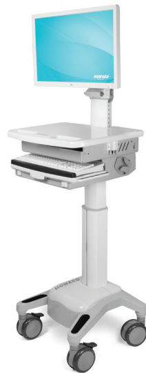
HI-CORE LCD CART