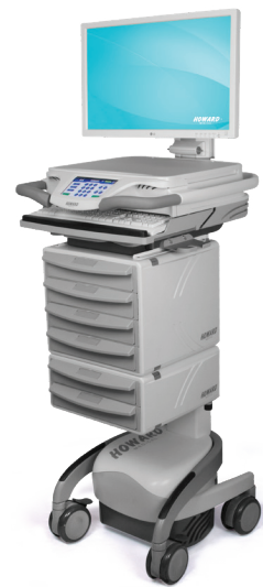
HI-CARE E 6-TIER STORAGE