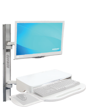
CONDOR LITE ARM