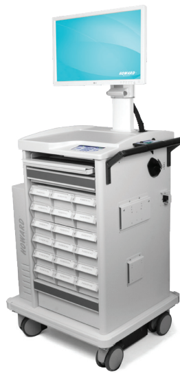
HI-PINNACLE E MODEL 15