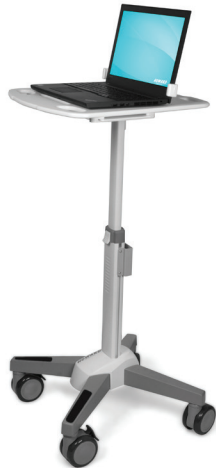
HI-SWIFT NOTEBOOK CART