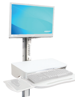
FALCON LITE ARM