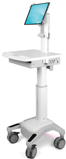
HI-CORE TABLET CART