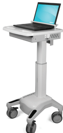
HI-CORE NOTEBOOK CART