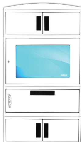
AUXILIARY STORAGE STATION