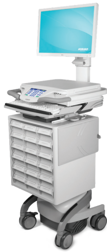
HI-PARADIGM E 6-TIER