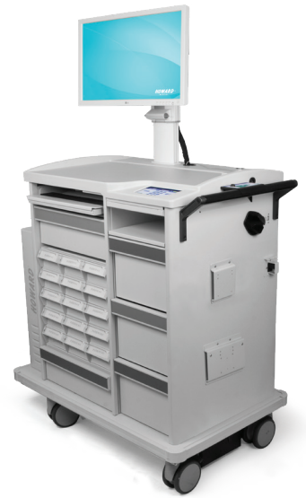
HI-PINNACLE E MODEL 45