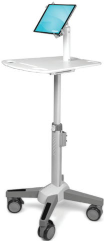
HI-SWIFT TABLET CART