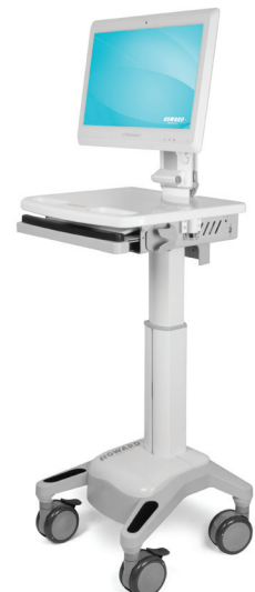
HI-CORE ALL-IN-ONE CART