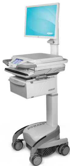
HI-CARE E 2-TIER STORAGE