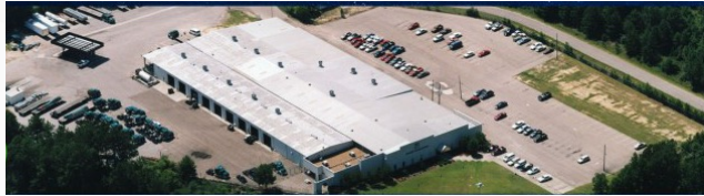
Ellisville Transportation Facility