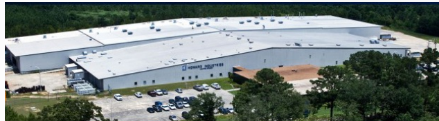
Sandersville Ballast Facility