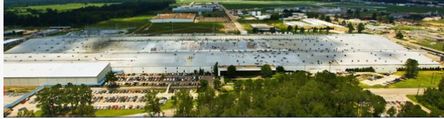
Laurel Transformer Facility