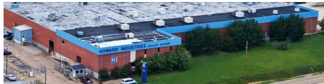
Mendenhall HID Facility