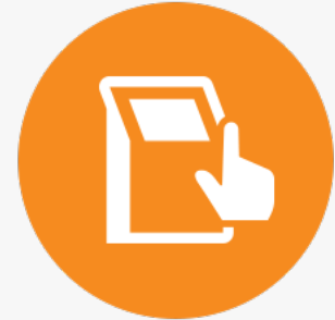
Kiosks and Digital Signage