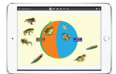
Student using the MimioStudio Collaborate feature.

Get the most from your mobile devices with truly collaborative learning.