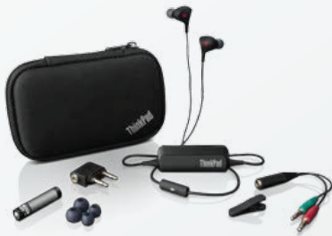
ThinkPad Noise-Cancelling Earbuds