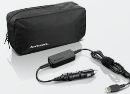
Lenovo® 65W DC Travel Adapter