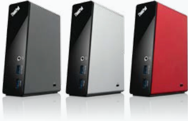
ThinkPad® OneLink Dock