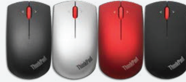
ThinkPad Wireless Precision Mouse