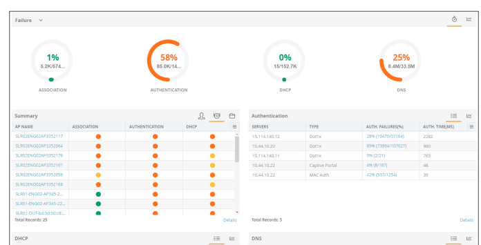
Figure 4: Aruba AirWave Connectivity Health

A reliable connection is the foundation of a successful user experience. AirWave monitors the connectivity of clients, to proactively help identity and resolve issues. Data points include client association, as well as network authentication and DHCP metrics.