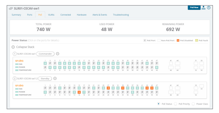
Figure 2: Aruba AirWave Switch Faceplate View

When looking at switch information, additional visibility into key values of individual and stacked switches is provided. This includes port status, PoE consumption, VLAN assignment, device and neighbor connections, power status and trends, alerts and events and which troubleshooting actions can be performed.