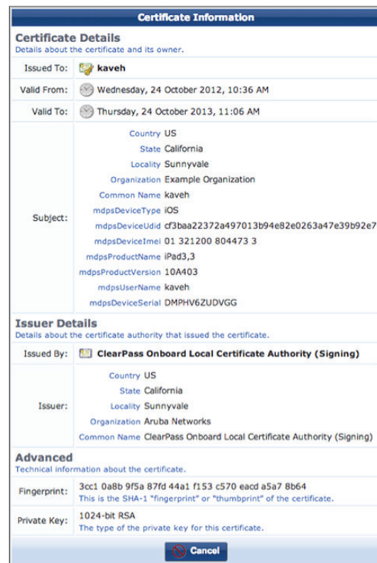
Details of unique credentials for onboarded BYOD endpoints.

ClearPass also supports the distribution of Onboard generated certificates requested by third-party applications – mobile device management (MDM) or enterprise mobility management (EMM) – through SCEP and EST (RFC 7030) protocols.