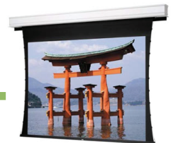
Da-Lite Cosmopolitan Electrol

Howard audio visual solutions increase the effectiveness and impact of meetings and presentations. They range from a single projector and screen to multiple monitors, integrated audio, video conferencing and total control systems from Crestron, Extron, and SP Controls. Each system is designed to satisfy current requirements and expertly engineered to ensure high reliability.