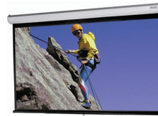
Da-Lite Model C