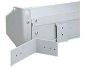
Da-Lite Floating Mounting Bracket