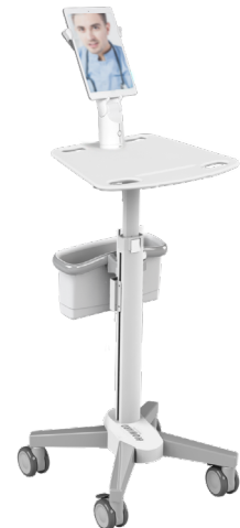
KS KUBI SWIFT CART