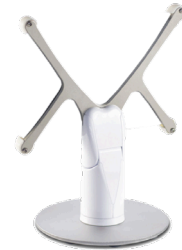
KUBI SECURE (FITS 12.9" IPAD ONLY)