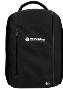
SK SOFT TELEMEDICINE KIT