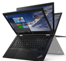
THINKPAD X1 YOGA