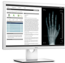
24" MEDICAL GRADE