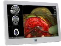
24" MEDICAL GRADE