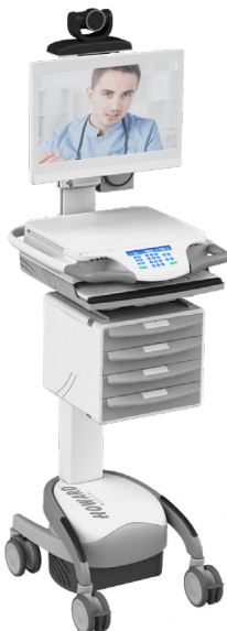
CA TELECARE CART