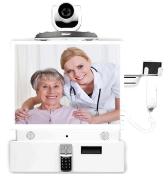
F FLEX MOUNT