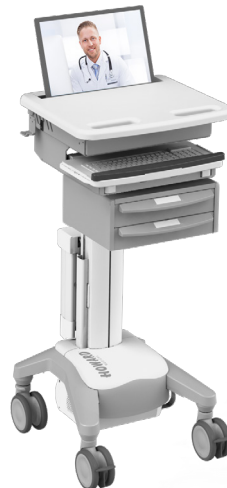
CO TELECORE CART