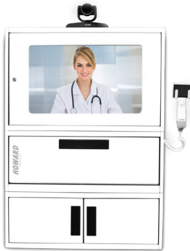
C TELEMEDICINE CABINET