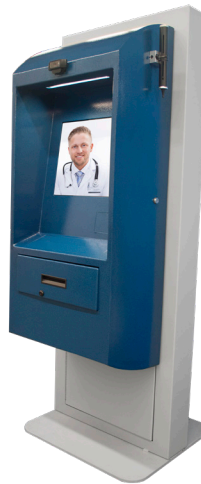
K TELEMEDICINE KIOSK