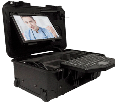
RK RUGGED KIT