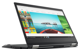
THINKPAD YOGA 370