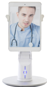
KUBI CLASSIC (FITS 10.0"-13.0" TABLET)