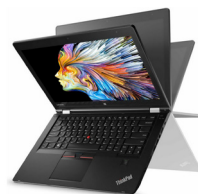
THINKPAD YOGA P40