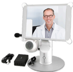
ENHANCED AUDIO PACKAGE (INCLUDED WITH EACH KUBI)