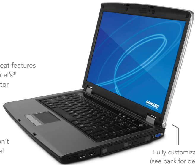
Fully customizable (see back for details)

The HEL81A is a powerful, high performance notebook that offers great features such as an Intel® Core™ 2 Duo processor, up to 4GB of DDR2 RAM, Intel's® integrated high definition audio, and Intel's® graphics media accelerator 950. The 15.4" high-gloss TFT LCD WXGA allows you to complete assignments in the comfort of your office or outside on the go. With both PCMCIA and Express card slots, this notebook offers the compatibility and flexibility you demand. The HEL81A comes equipped with your choice of Microsoft® Windows® XP, Microsoft® Windows® XP Home Edition, or Microsoft® Windows® Vista™. And don't forget to choose your favorite custom skin to let your personality shine!