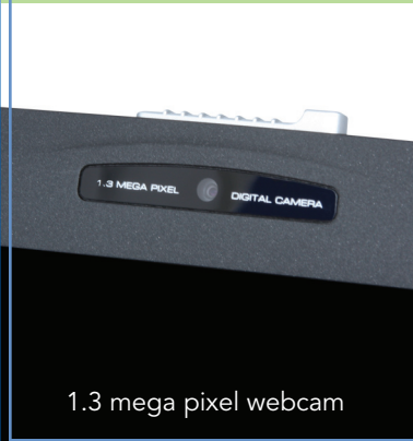
1.3 mega pixel webcam