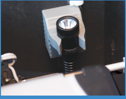
Streamlight Strion® Flashlight