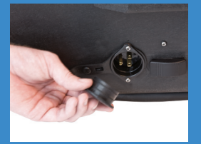
AC/DC Rocker Switch