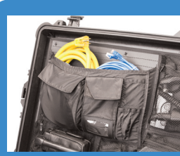
Cables • Cat-5 • USB