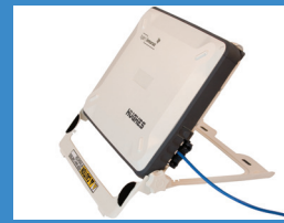
BGAN • Hughes HNS 9201 • Thrane and Thrane Explorer® 500