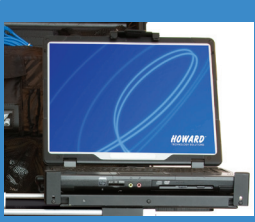
Rugged Notebook • Howard JAG HS3 • Panasonic Toughbook 30