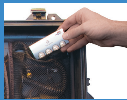
Targus USB 2.0 Hub