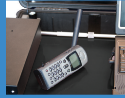
Iridium Satellite Phone