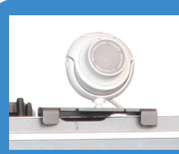
Microsoft® LifeCam VX 6000