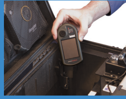
Handheld GPS • Garmin Rino® 530HCx • Garmin GPS 60™