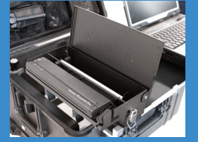
Pentax® Pocketjet® 3 Printer