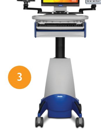
Elmo Model with optional monitor