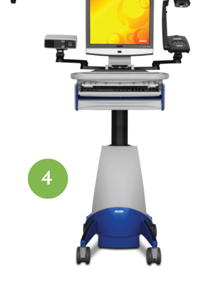
Avermedia Model with optional Howard QN1 pc