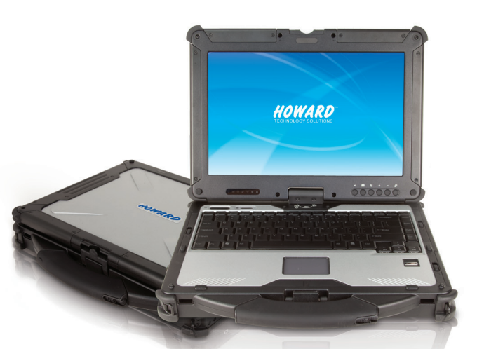
Fully Rugged and Semi Rugged Notebooks and Tablets