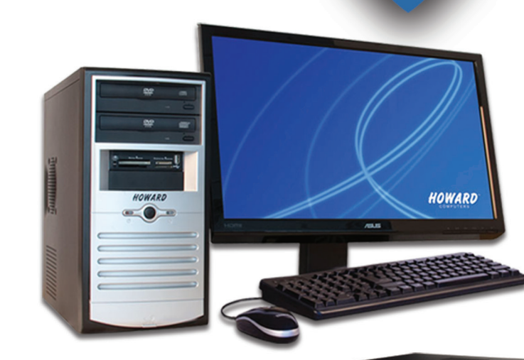
Workstations and Desktops