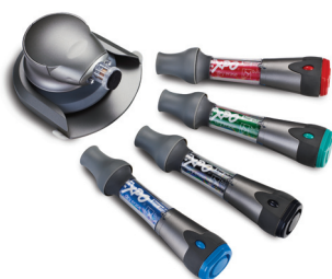
mimio® Capture kit digitally records dry-erase marker