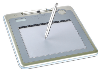
mimio® Pad lets you control your system throughout the room