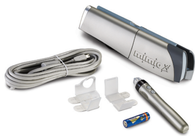
mimio® Interactive bar, mimio® mouse, USB cable (16'5 m), battery for mimio® mouse, mounting brackets