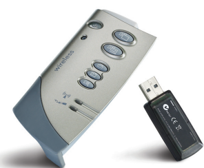
mimio® Wireless module and USB receiver