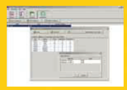
Spend less time grading tests and quizzes and increase your lesson planning time.