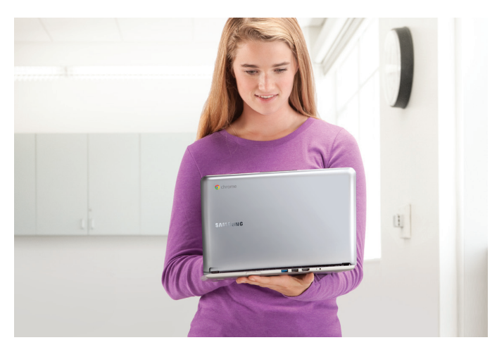
Samsung Chromebooks are ultraportable, sleek laptops for everyday adventures in school and beyond. And because they're as light as 2.4 pounds, as thin as 0.7 inches, and have up to 7 hours of battery life, students can take them wherever they want to go.

Enrich your students and classes with an endless selection of educational videos, literary films and classic songs. For movies and videos, try YouTube for Schools, YouTube EDU and Netflix.