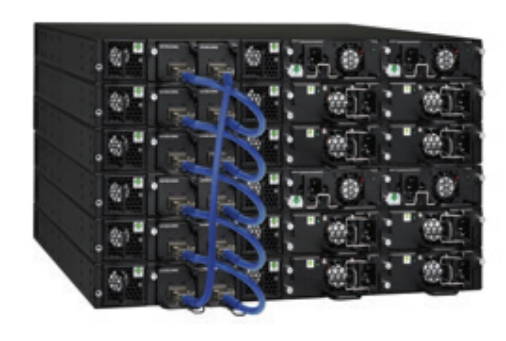
Figure 3: Brocade ICX switches can be stacked together using standard SFP+ or QSFP+ ports and optics to create a single logical device over distances up to 10 Km