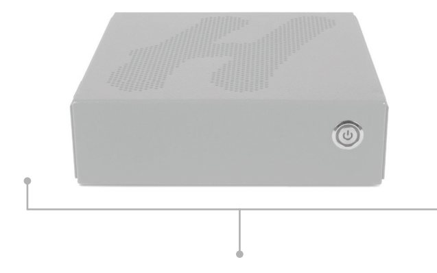
only 7.5" wide