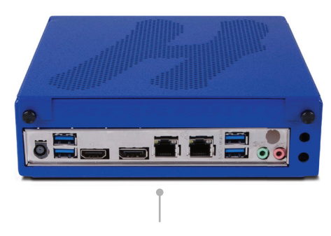
The standard Howard DR back ports: (1) Display, (1) HDMI, (2) LAN (RJ45) ports, (4) USB 3.0 (blue), (2) audio jacks, (1) DC power connector