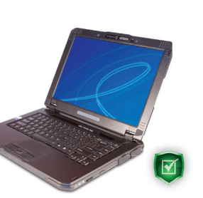
Howard JAG HS6 High performance, semirugged notebook