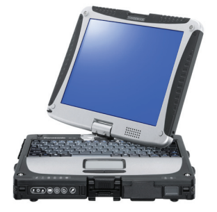
ideas for life

Toughbook 19 Fully-Rugged Laptop Convertible Tablet