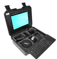
Compact Rugged Telemedicine Kit