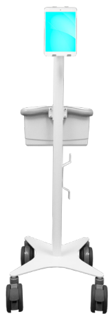
HI-View TelePresence Cart