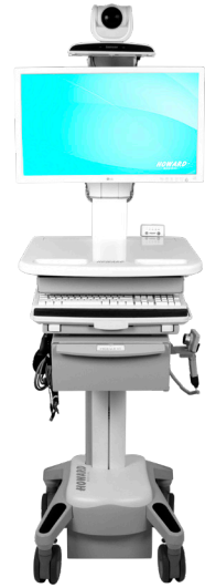
TeleCore LCD cart