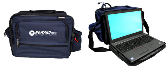
Shoulder Bag Soft Telemedicine Kit