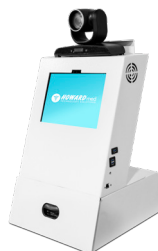
Customized A1 Telehealth Kiosk