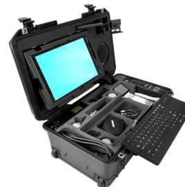
Medium Rugged Telemedicine Kit