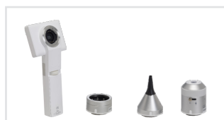
Multipurpose Exam Camera With General Viewing, Otoscope, & Dermoscope Lenses