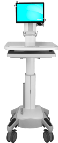
TeleCore tablet cart