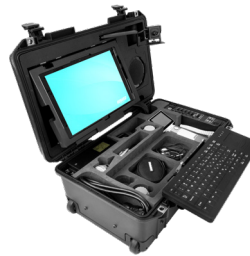
Rugged Telemedicine Kit RTK 22