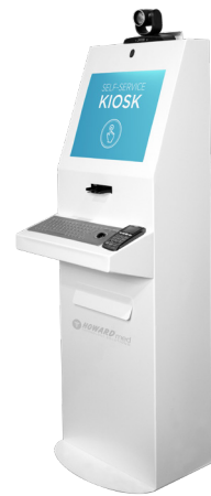
Freestanding Telehealth Kiosk