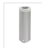
Fundus Lens for Multipurpose Camera