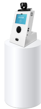
Tabletop Telehealth Kiosk