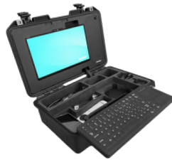
Rugged Telemedicine Kit RTK 19