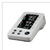
Spot VSM with BP, Temp, and SpO2