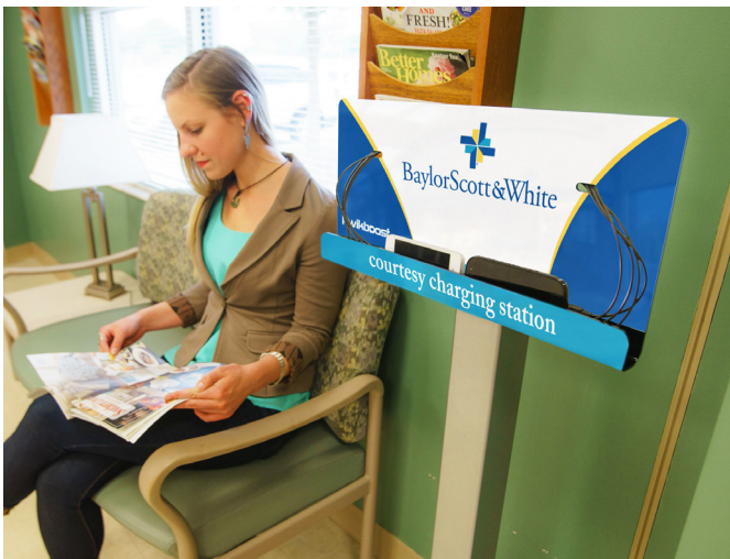
Floor Stand Charging Station

Charging lockers located in nursing stations provide a safe place to charge and store electronic devices for employees. This ensures that devices are fully charged, accessible, and ready to use at any time, which, in turn, helps streamline workflows and improve productivity. Some charging units offer an extra level of security by providing a full audit log, coded access, or RFID access, which lowers your per-employee cost by reducing the number of lost or stolen devices. Patients who are on-site for outpatient procedures and need somewhere to store their devices or valuables can benefit from these lockers, too.