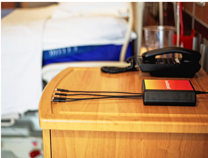
Mini Charging Hub

Give visitors a safe, convenient way to recharge all their mobile devices with secure, purpose-built charging lockers and charging stations. They are durable, designed for high-traffic environments, and a safe alternative to using facility outlets meant for medical equipment. Placing these easy-to-use charging solutions in waiting rooms or common areas of your facility allows guests to use their devices without having to worry about depleting the battery. When a device does need charging, nurses and receptionists can simply direct visitors to the nearest charging station.