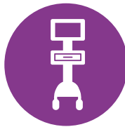
point-of-care solutions & technology