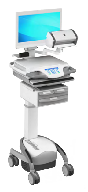
HI-Care E Cart (shown with a selection of optional accessories)

Maximize patient engagement; streamline check-in processes, increase pointof-service collections, and more with Howard's patient check-in solutions. Our solutions can be integrated with multiple technologies and hardware that are EHR supported. Howard check-in solutions are designed to improve patient satisfaction and can be customized to enhance workflows throughout your entire facility.