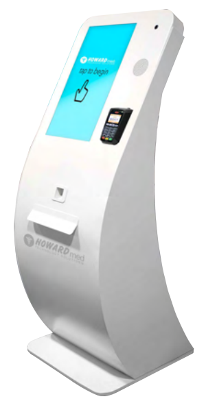
Howard W1 Freestanding Kiosk