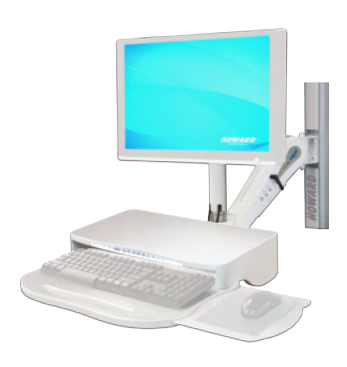
Falcon Arm Wall Mount