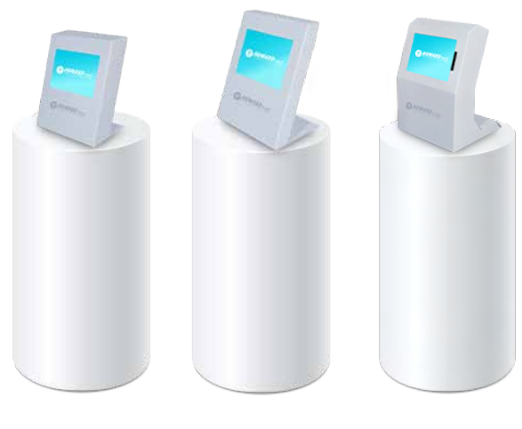
Howard A1 Tabletop Kiosk