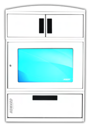
Cabinet Wall Mount