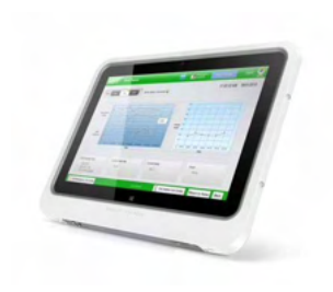
HP ElitePad 1000 G2 Healthcare Tablet