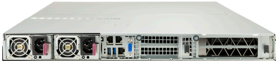
1U Rack-mount- Rear View