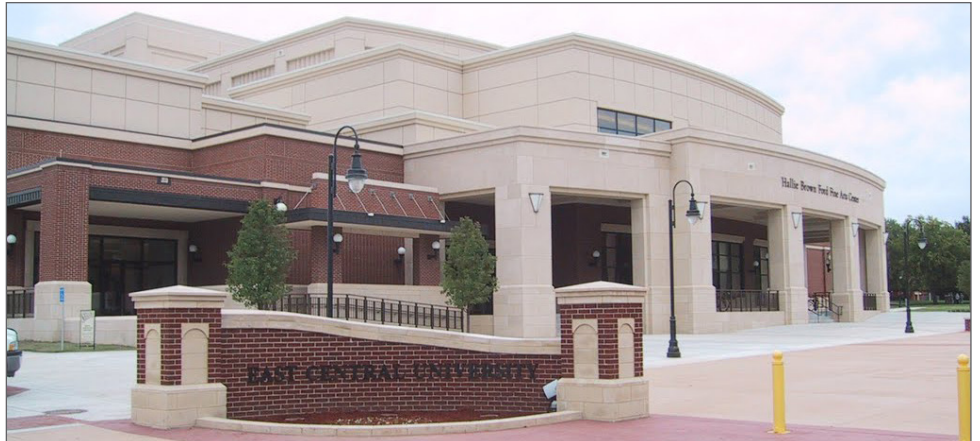
East Central University, Ada, Oklahoma

Howard Technology Solutions upgrades technology in ECU's Raymond J. Estep multimedia center with new, state-of-the-art audiovisual technology