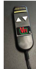
Cable push-button remote