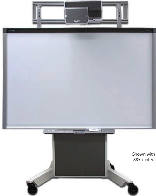
Shown with **SMART Board® 885ix interactive whiteboard