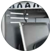
OVERHEAD CORD MANAGEMENT