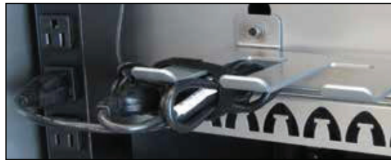
UNIQUE ADAPTER POST MANAGES EACH ADAPTER AND CORDS ON AN INDIVIDUAL POST THAT HELPS TO DISSIPATE HEAT.