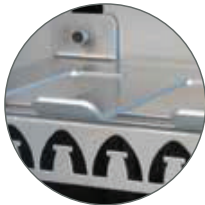
UNIQUE ADAPTER POST