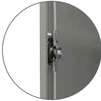
TWO POINT DOUBLE-BOLT LOCK