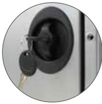
DOUBLE-BOLT KEYED SECURITY LOCK