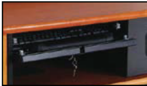
(O) Pull-Out Locking Laptop Storage/Keyboard Tray 55247

Drawer front flips down with integral wrist pads. The locking drawer can be used for keyboards or to secure a laptop.