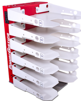
6 Shelf Desktop Tower 12.5"W x 12.75"D x 17.75"H