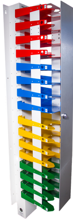
16 Shelf 4 Color Option 10"W x 15.25"D x 60.5"H