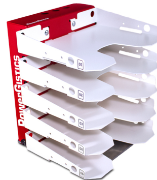
5 Shelf Desktop Tower 12.5"W x 13"D x 15.75"H