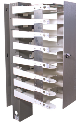
8 Shelf Wall Mount Tower 10"W x 15.25"D x 37"H

Available in both locking and non-locking models