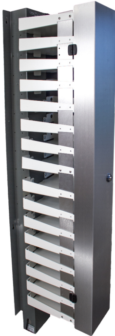
16 Shelf Wall Mount Tower 10"W x 15.25"D x 60.5"H