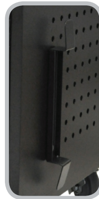
Side cord wrap for convenience.