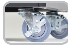
Coated dividers and non skid casters