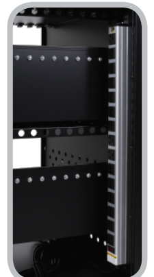
Rear access door of the LLTM30-B open to the power strips.