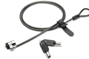
Kensington® MicroSaver Security Cable Lock by Lenovo®