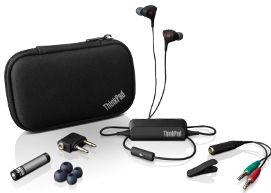
ThinkPad® Noise-Cancelling Earbuds