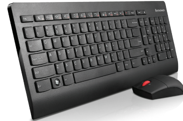
Lenovo® Ultraslim Wireless Keyboard and Mouse Combo