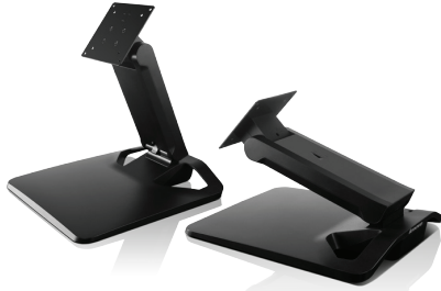
Lenovo® Universal All-in-One Stand