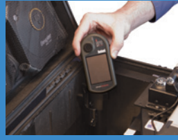
Handheld GPS • Garmin Rino® 530HCx • Garmin GPS 60™