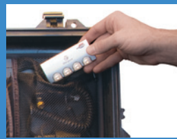
Targus USB 2.0 Hub