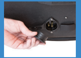
AC/DC Rocker Switch