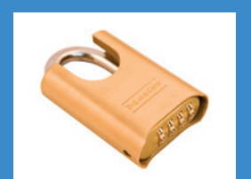
Master Lock® Padlock