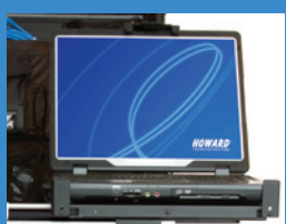
Rugged Notebook • Howard JAG HS3 • Panasonic Toughbook 30