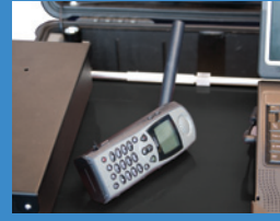
Iridium Satellite Phone