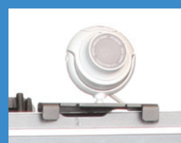
Microsoft® LifeCam VX 6000