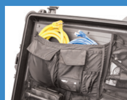
Cables • Cat-5 • USB