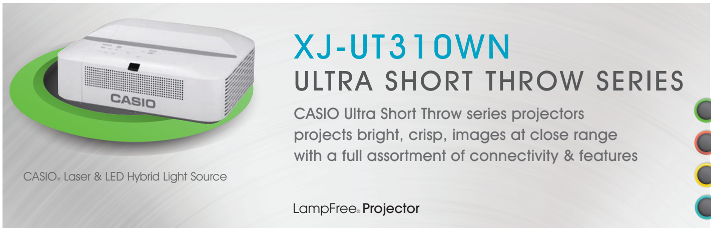
CASIO® Laser & LED Hybrid Light Source