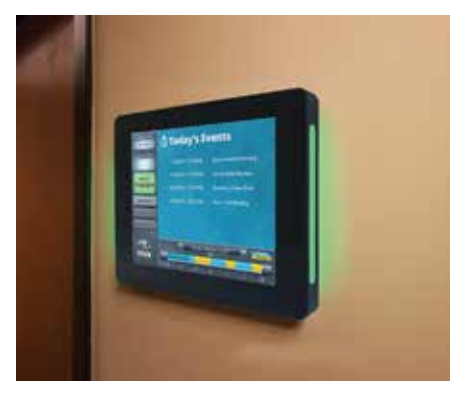
MeetingMinder™ Touch10 Mounted -Room available

We're happy to provide pricing and specifications for individual units, facility packages, or integrated solutions combining Touch room signs with our RoomBoard™ and custom interactive wayfinding maps.