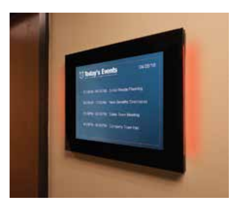
MeetingMinder™ Touch15 Recessed -Room reserved