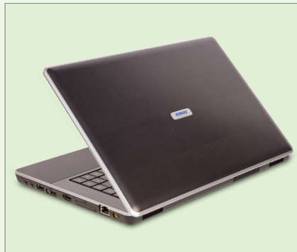
Docking Station Optional