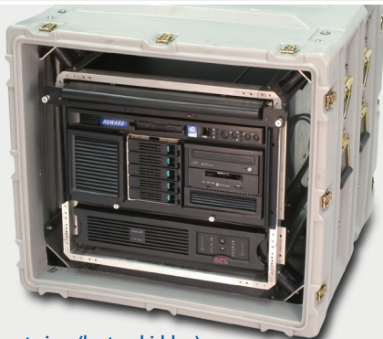
Front view (laptop hidden)