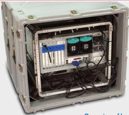
Open view of back