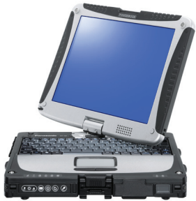
Toughbook 19 Fully-Rugged Laptop Convertible Tablet

Fully-rugged, convertible tablet PC. 10.1" sunlight-viewable touch or dual touch LCD. Capable of up to 6000 nit in direct sunlight. Optional 4G LTE or 3G Gobi.