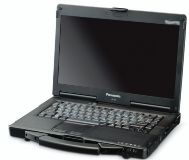
Toughbook 53 Enhanced performance and versatility from the original semi-rugged laptop manufacturer

Semi-rugged Desktop Alternative, 15.4" Widescreen, Mobile broadband ready with Gobi Technology.