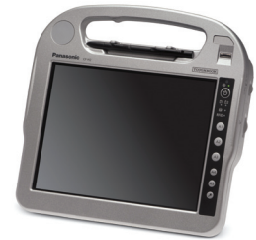
Toughbook H2 Handheld Tablet

Fully-rugged MIL-STD-810G and IP65 certified. 13.1" 1200 nit LCD. Mobile broadband ready. Optional 3G Gobi™ or 4G LTE mobile broadband.