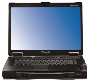
Toughbook 52 The Ultimate in Power and Portability

Semi-rugged Desktop Alternative, 15.4" Widescreen, Mobile broadband ready with Gobi Technology.