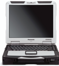
Toughbook 31 Powerful, Rugged and Wireless

Fully-rugged, convertible tablet PC. 10.1" sunlight-viewable touch or dual touch LCD. Capable of up to 6000 nit in direct sunlight. Optional 4G LTE or 3G Gobi.